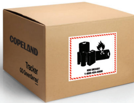
Tracker shipping box