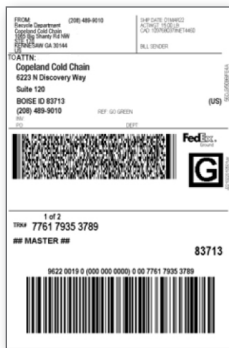
Pre-paid FedEx label