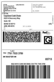
Pre-paid FedEx label