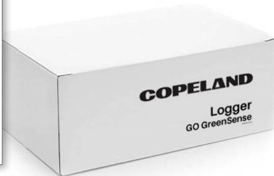
Logger shipping box